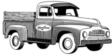
CAROLINES COFFEE GRASS VALLEY, CA 95945

A big thanks to Carolines for donating coffee to our cast & crew.